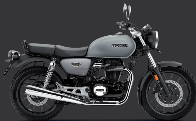
Pearl Deep Ground Grey

*Product shown in the picture may vary from actual product available in the market.