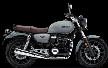
Pearl Deep Ground Grey