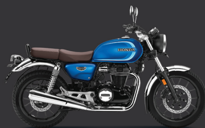
Athletic Blue Metallic