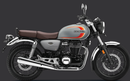
Pearl Deep Ground Grey